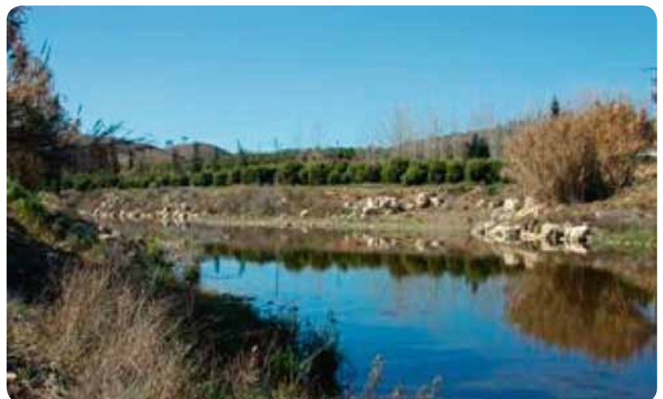
View of degraded segment in Odelouca river

In the ongoing EU project Ricover ( http://www.ricover.eu/ ), about 7 km of river length will be restored (2010-2012, see Figure), including reshaping and stabilisation of banks and reconstruction of the riparian woods. Prior to restoration, all biological and physical elements were surveyed, and they will be monitored in the next years. Also attached is the Seminar of February program, the leaflet is being made to circulate as soon as possible