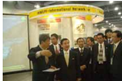
Exhibition in World Water EXPO