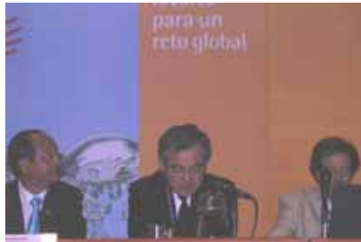
Topic session of INWEPF